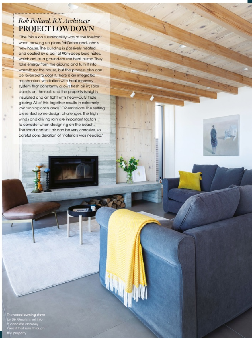
The wood-burning stove by Dik Geurts is set into a concrete chimney breast that runs through the property.

"The focus on sustainability was at the forefront when drawing up plans for Debra and John's new house. The building is passively heated and cooled by a pair of 90m-deep bore holes, which act as a ground-source heat pump. They take energy from the ground and turn it into warmth for the house, but the process also can be reversed to cool it. There is an integrated mechanical ventilation with heat recovery system that constantly allows fresh air in; solar panels on the roof; and the property is highly insulated and air tight with heavy-duty triple glazing. All of this together results in extremely low running costs and CO2 emissions. The setting presented some design challenges. The high winds and driving rain are important factors to consider when designing on the beach. The sand and salt air can be very corrosive, so careful consideration of materials was needed."