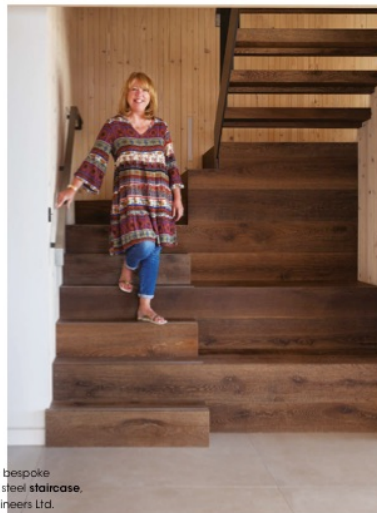
Debra on the bespoke wooden and steel staircase, from R&E Engineers Ltd.

We were keen to build something that fitted with the environment and exposed nature of the site. We have used natural materials, have solar panels, a fresh-air circulating system and a ground-source heat pump. Our bills are so low.