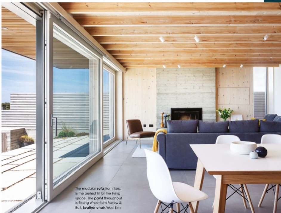
The modular sofa, from Ikea, is the perfect fit for the living space. The paint throughout is Strong White from Farrow & Ball. Leather chair, West Elm.